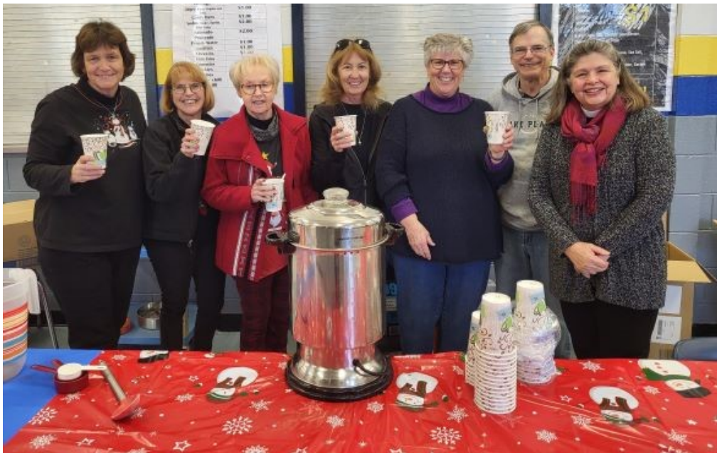
These brave folks served 350 cups of hot cocoa to the LBC Middle Schoolers in less than an hour! Thank you for loving our school!